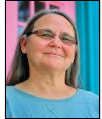
Suelaine Poling Keene Day Care Center