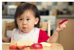
Nutrition, Health & Safety