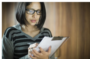
Compliance & Quality