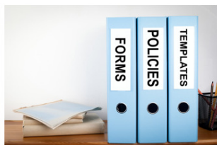
Forms, Policies & Templates