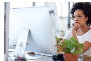
Training & PD