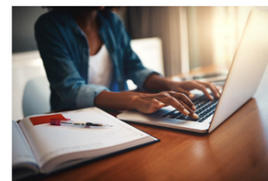
Family Child Care Toolkit