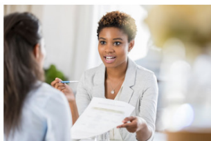
Becoming an HR Expert