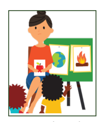
Center-based infant care $13,044