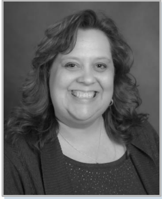
Tracy Pond CCAoNH