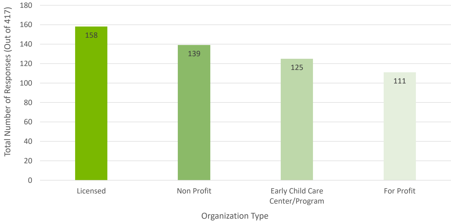
Top 4 Organization Responses